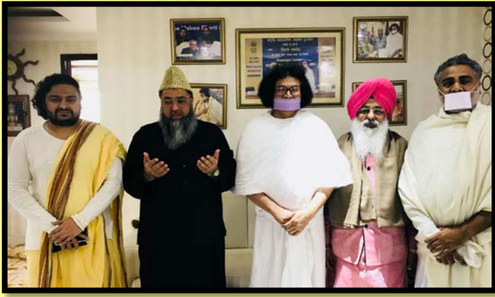
Interfaith Leaders visit Acharya Lokesh Ashram and discuss future Peace and Harmony Programs