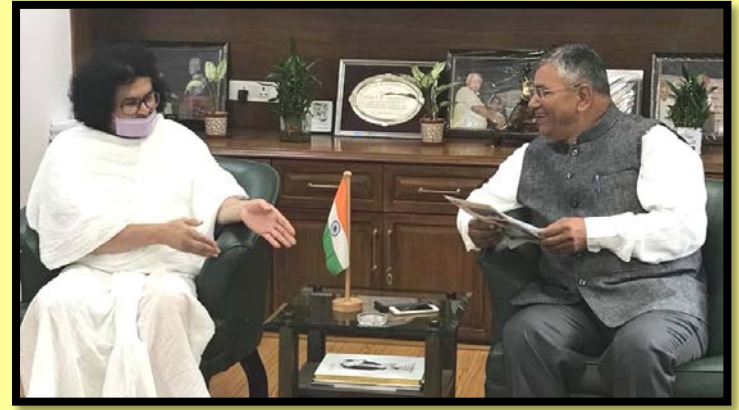
Acharya Lokesh discuss 'Vasudhaiva Kutumbkam' event with Cabinet Minister Shri P.P. Chaudhary