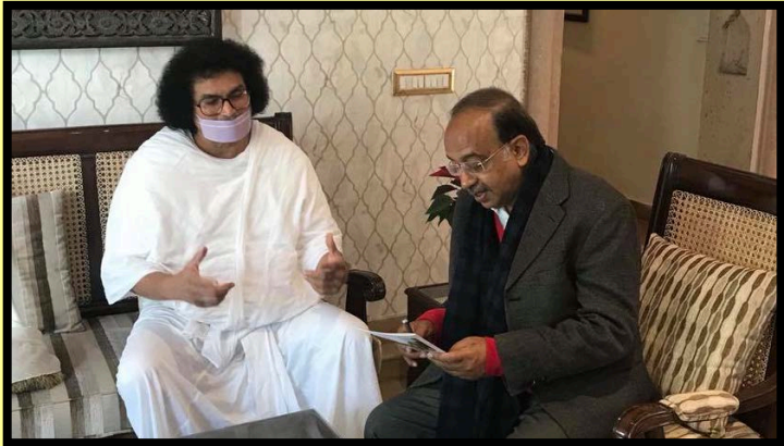
Acharya Lokesh discuss 'Vasudhaiva Kutumbkam' event with Central Minister Shri Vijay Goel